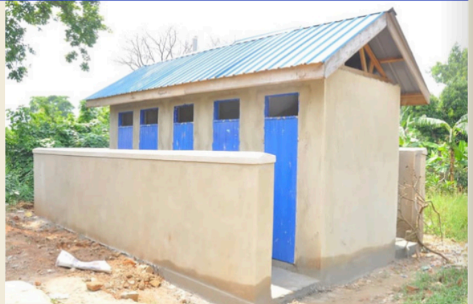
NEW LATRINES FINISHED IN 2018

Sanitary conditions at the schools we work with is critical to ensure children coming to school do not get sick due to poor hygiene. New latrines were constructed replacing pit latrines and offer children privacy.