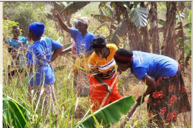
GROW MATOOKE 2021

A Ugandan farm is simply not a Ugandan farm without Matooke! Acreage was expanded in 2021 to plant matooke trees. They grow like and have a taste similar to plantains.